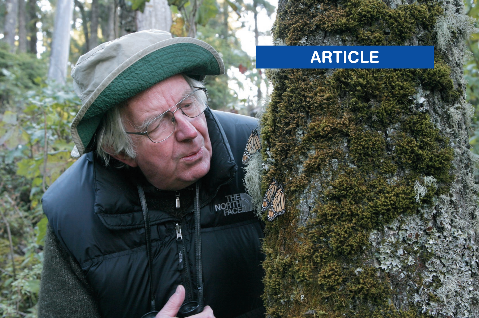
"Monarch whispering", Mexico, December 2006.